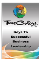
Keys to Successful Business Leadership