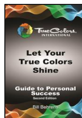
Let Your True Colors Shine Guide to Personal Success